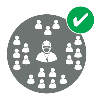
20 participants at one time including coach* *Coaches may only coach one squad of 19 at once. They must not work across multiple areas.