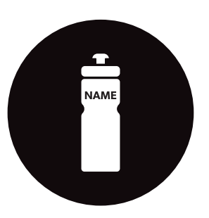
Fill and bring your own clearly labelled drink bottle from home